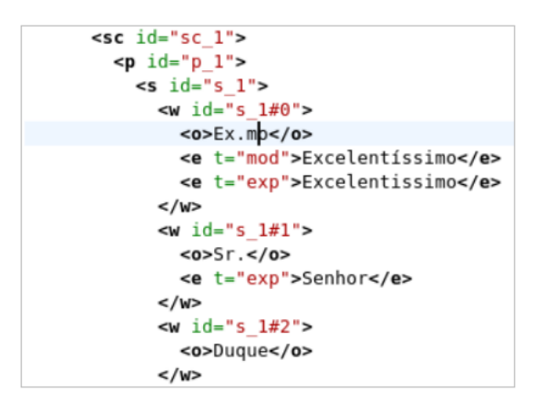
Figure 3: Example of XML textual encoding.

Finally, the integration of the whole process into one and only environment is a second factor for the overall improvement, for it allows the user to move freely and quickly between "representations" and